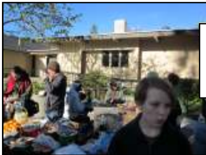
Celebrating A Mitchell Park Christmas